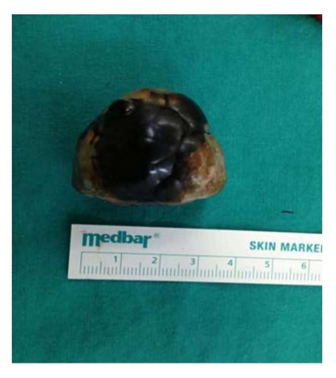
Figure 2. Giant ureteral stone [3,5x3cm]